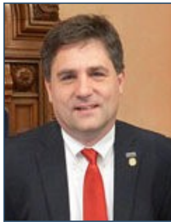
Patrick Colbeck Michigan State Senate District 7, & Candidate for Governor